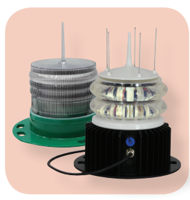
ΔΡΟΠΟ-155 & SL-125 lanterns

In addition, the AIS enabled AtoN broadcasts AIS Message 6 received by the designated base station, allowing the operator to monitor the AtoN for solar and battery voltage, flash code setting and light status. Meteorological and hydrological data and a host of other parameters can be fitted.