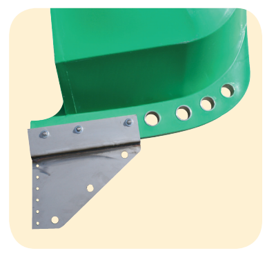
Stainless steel keel ensures buoy remains stable in faster water currents