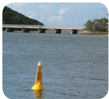
SL-B700 with SL-70 light installed in Victoria, Australia