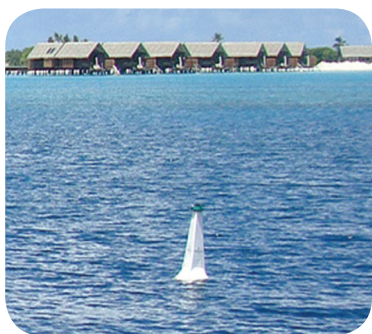
SL-B700 with SL-15 solar lantern, Maldives