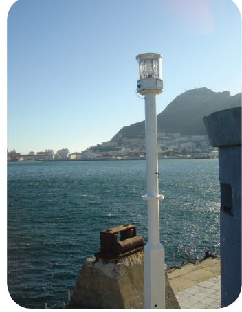
SL-RL400, South Mole, Gibraltar