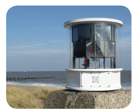
SL-RL400 shown with 16 panel array in weatherproof housing

The design allows easy top access for relamping duties and complete removal of the turntable and electrics for major servicing every 5 years.